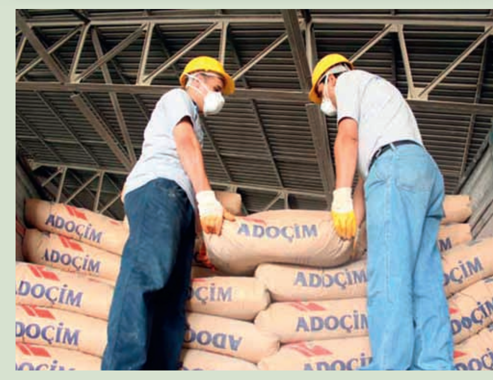
Adocim Cimento, Turkey